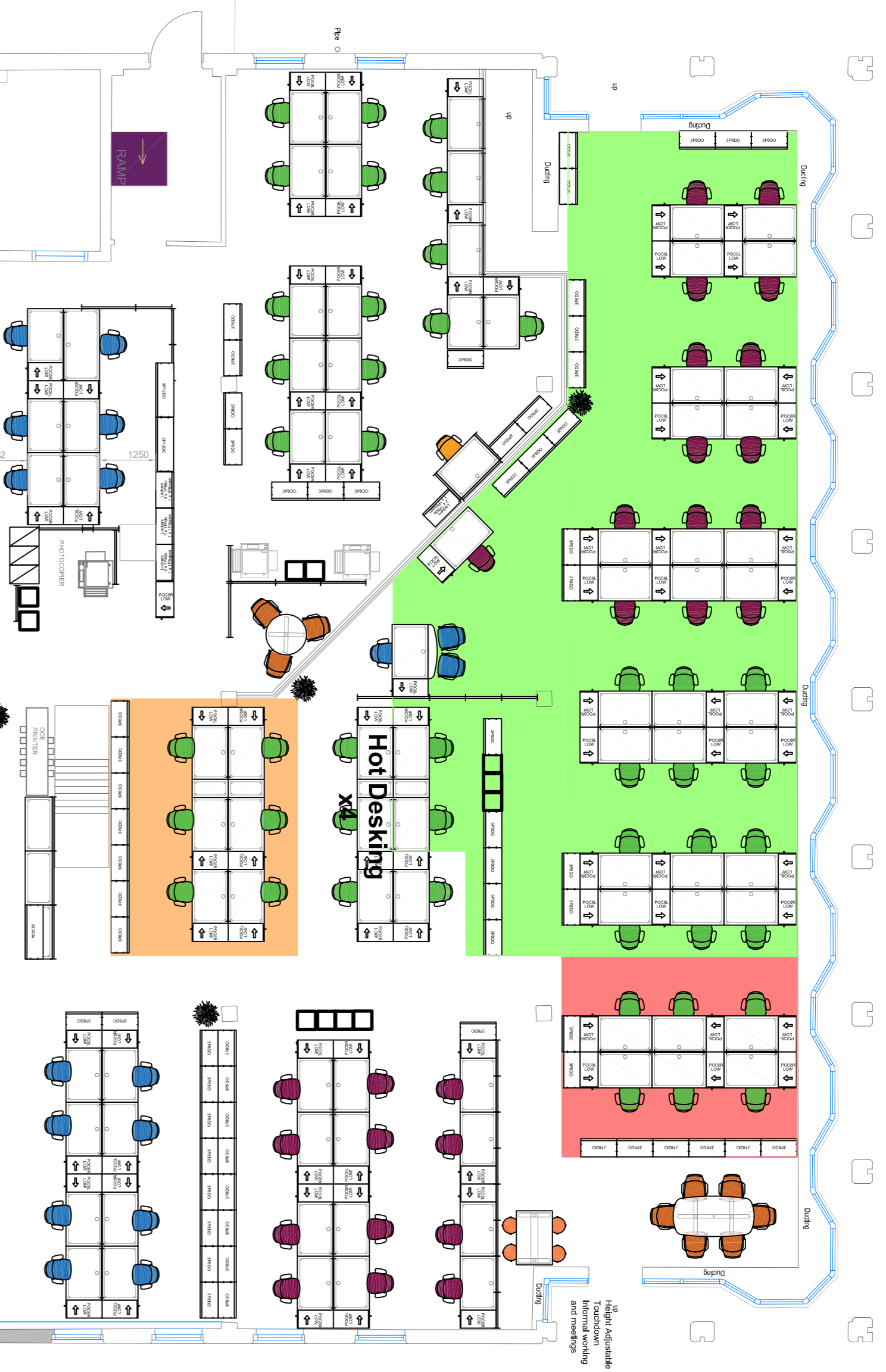
Floor Plan - Area 1 scale 1:100