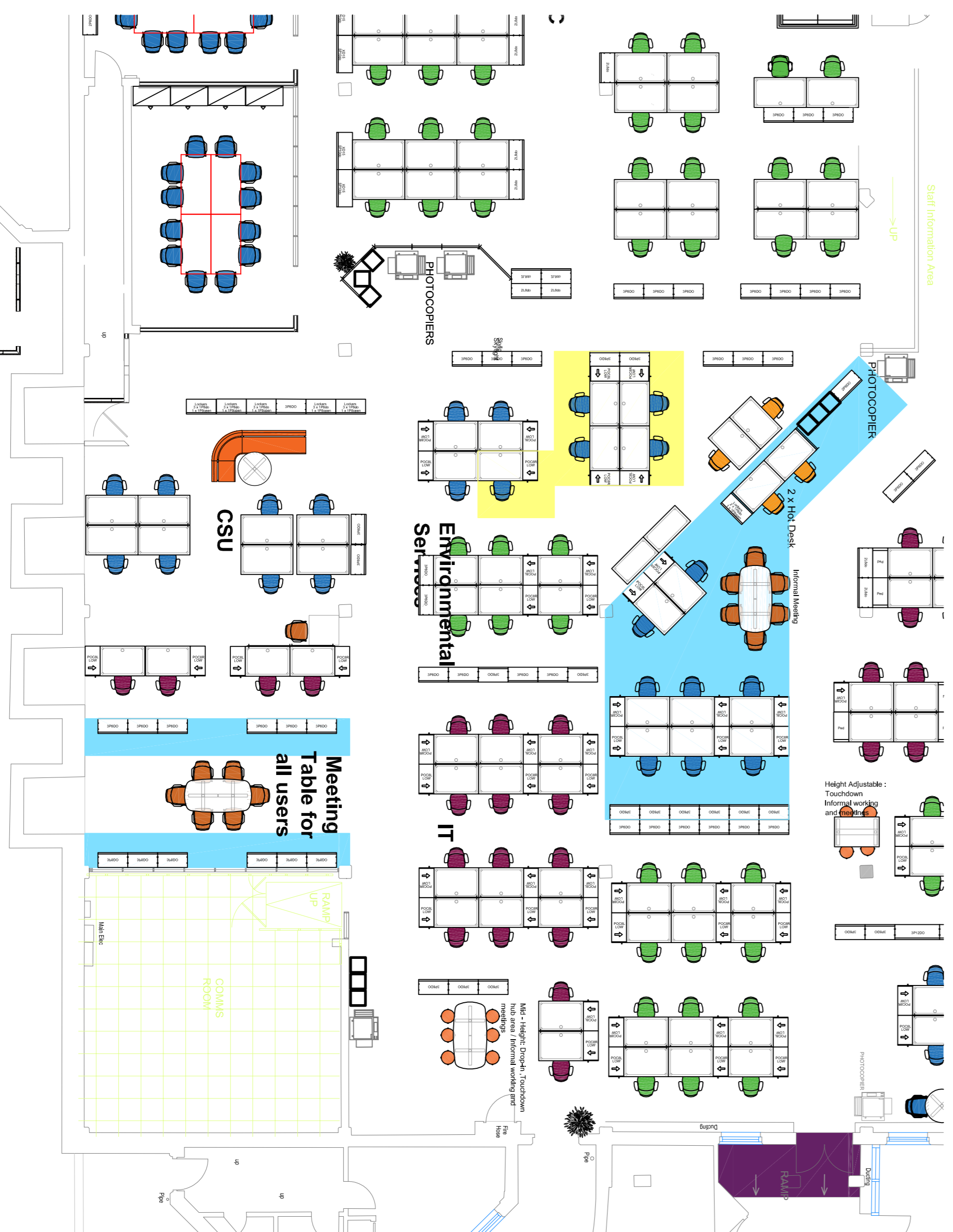
Floor Plan - Area 2 scale 1:100